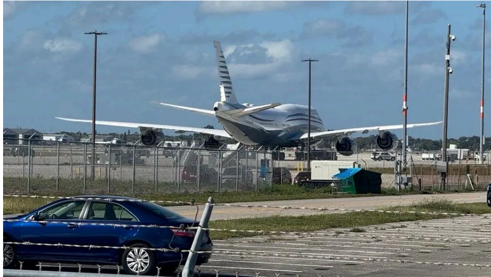
Trump toured the plane in Palm Beach back in February

In February, Trump said he was "not happy with Boeing" about delays to two new Air Force One jets that he is expecting to receive directly from the firm. He added that the White House could instead "buy a plane or get a plane, or something".